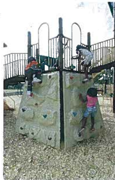
Fossil Bluff Climber