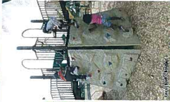
Rocky Bluff Climber