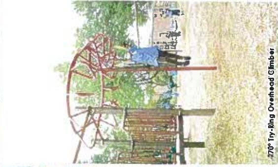
70° Tri-Ring Overhead Climber