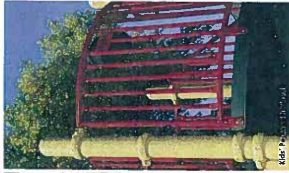
Kids' Paradise Climber