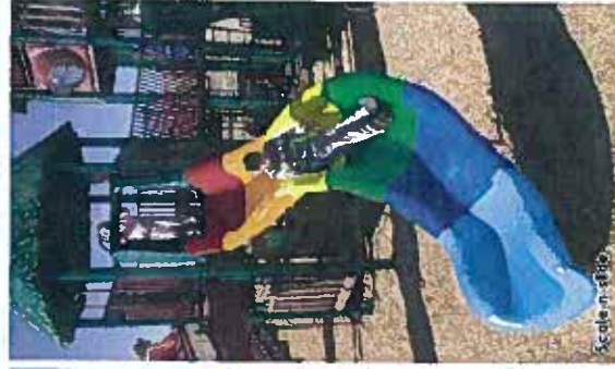
Scale n' Slide