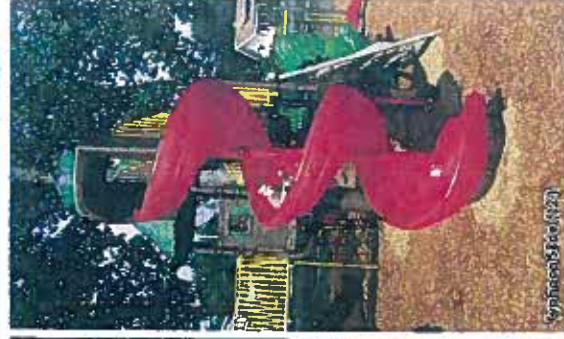
Symphony Swing (12)