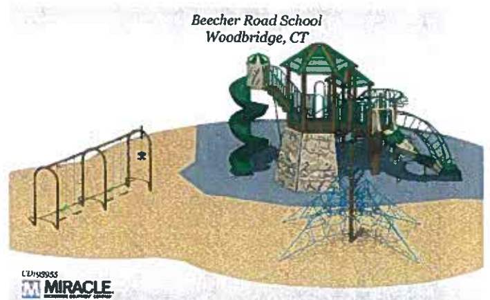
Beecher Road School Woodbridge, CT

Planning is also underway for the design of a new South playground to accommodate the school's intermediate grades. Look forward to updates as we move forward!